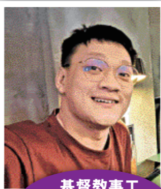
基督教事工 高級文憑課程 畢業生 (2022)