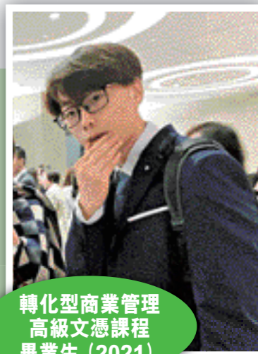
轉化型商業管理 高級文憑課程 畢業生 (2021)

在宏恩的學習期間，他曾獲頒自資專上獎學金計劃 2019-20 之「才藝發展獎學金」(Talent Development Scholarship)，以及由聯合國南南合作辦公室 (The United Nations Office for South-South Cooperation, UNOSSC) 舉辦的商業項目比賽 (Business Competition) 第三名。畢業後，他已經獲得其他院校取錄入讀學位課程。他計劃於完成本科學位課程之後，繼續攻讀碩士課程。