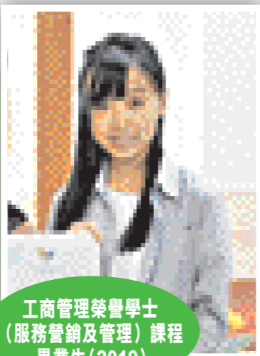
工商管理榮譽學士 (服務營銷及管理) 課程 畢業生 (2019)

畢業後，她從事市場推廣及宣傳活動工作，現在她任職於一間市場推廣公司，主要工作範疇是負責策劃及統籌市場推廣活動、網絡營銷、社交媒體營銷及管理、廣告宣傳及客戶服務工作，服務的對象群組是任何需要市場推廣及宣傳的商業或慈善機構。她希望將來修讀市場學 (Marketing) 以外的其他課程，不斷學習。