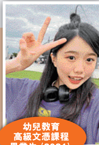
幼兒教育 高級文憑課程 畢業生 (2021)

在宏恩，她學習到怎樣去當一個好的幼稚園老師，例如幼稚園老師的角色應該具有的專業精神及態度，包括愛心及耐性等，以及適當地設計一些有趣及具啟發性的遊戲來提升小朋友的學習動機。畢業後，她繼續進修幼兒教育學位課程，希望可以獲取更高的學歷以投身專業的幼教人員行列。